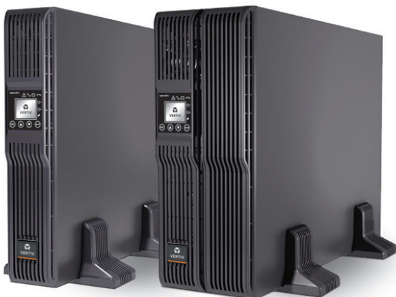
Liebert GXT4 700 - 3000 VA