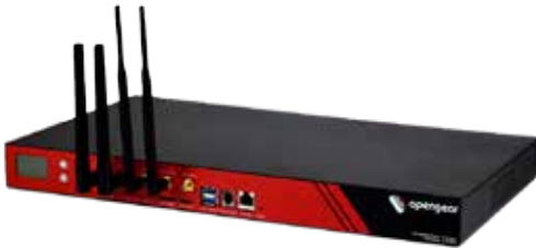
IM7200 Infrastructure Manager