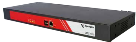
CM7100 Console Server