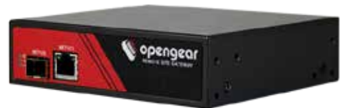
ACM7000 Remote Site Gateway