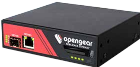
ACM7000-L Resilience Gateway